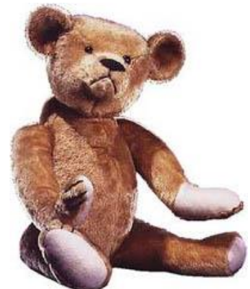
The original Roosevelt's teddy bear, held in the Smithsonian Museum.

Their original Teddy Bear, the one they sent to the White House, is still displayed in the Smithsonian to this day.