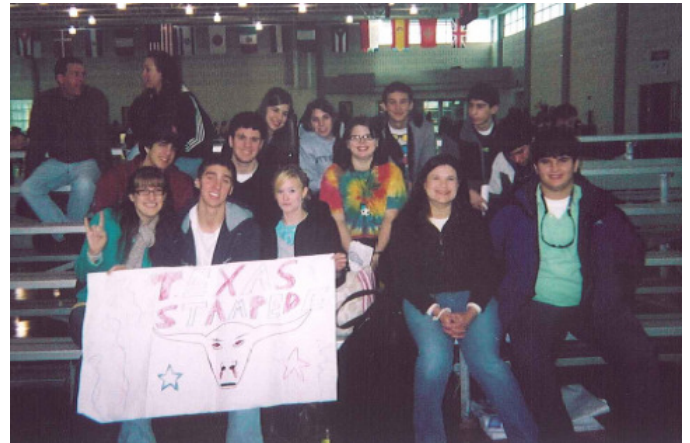
"Bama Subs" in Birmingham at a wheelchair rugby game